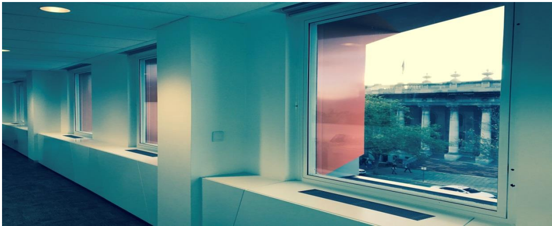
View of the State Parliament from the Members' Corridor at the new AAT premises